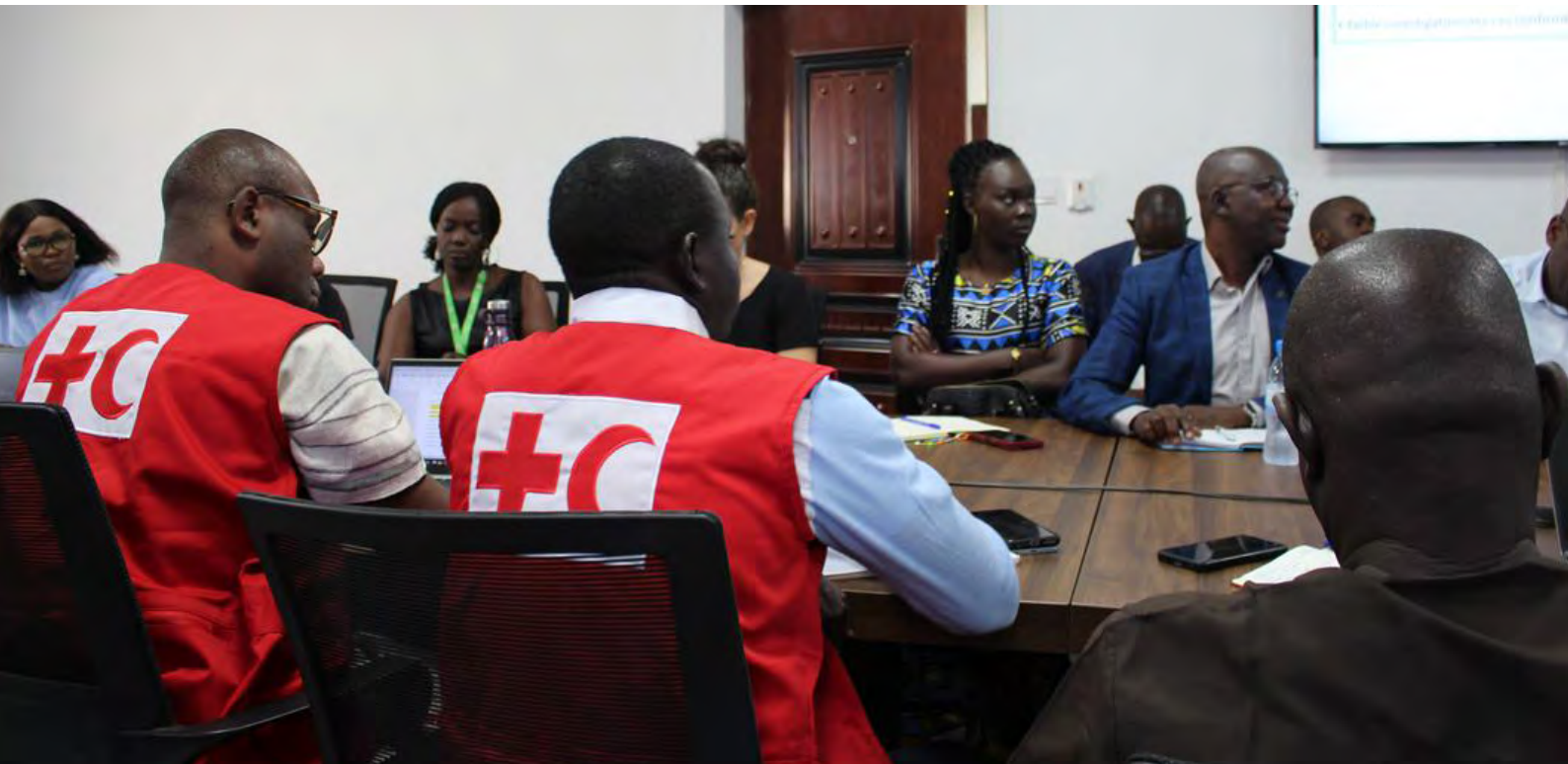
The Central African Red Cross Society conducting a workshop in response to the Mpox epidemic, in October 2024

Additionally, the IFRC will advocate with health authorities for the involving the Central African Red Cross Society volunteers in their health-focused activities across the health districts of the Central African Republic.