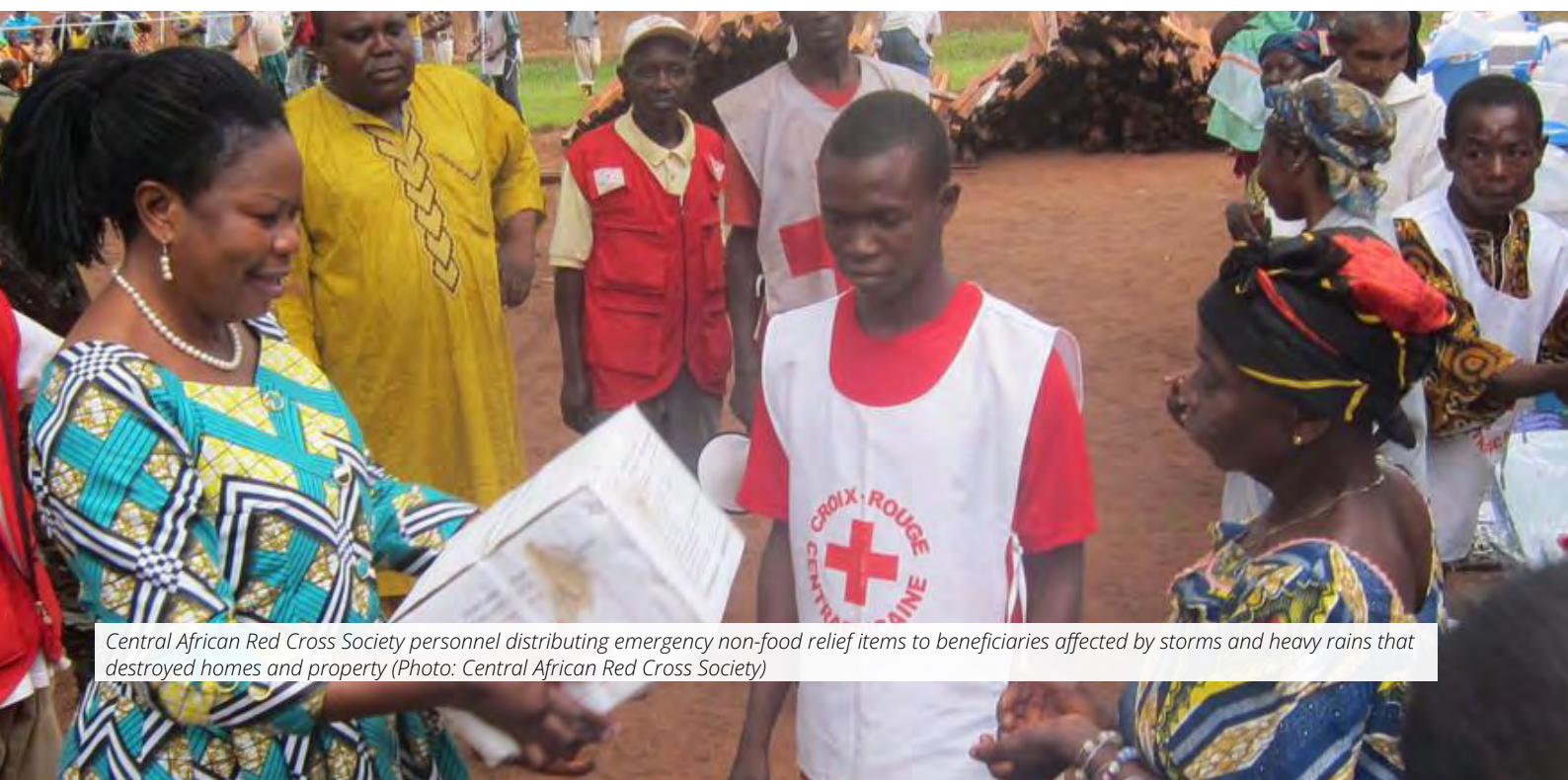
Central African Red Cross Society personnel distributing emergency non-food relief items to beneficiaries affected by storms and heavy rains that destroyed homes and property

The Netherlands Red Cross supports the National Society in youth empowerment and peacebuilding and the institutionalization of Community Engagement and Accountability (CEA).