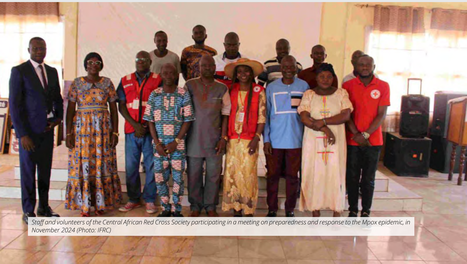
Staff and volunteers of the Central African Red Cross Society participating in a meeting on preparedness and response to the Mpox epidemic, in November 2024